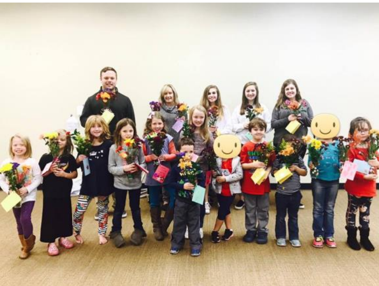
Photo from a previous Kind Kids Club activity, where they created flower arrangements for hospitalized children.

My acceptance of the position as Youth Leader here at Holy Communion coincided with the closing of Kind Kids Club by the mother/daughter duo founders as they moved to other challenges in their lives. It seemed such a nice fit with our Mission Statement: We are called by God to reach out and share the love of Christ, that I asked if we could take it over and roll it into Youth Group. This means that some Kind Kids members may come to Youth Group activities and we can increase our reach in this way. If you have any questions or comments about Kind Kids or Youth Group, please don't hesitate to email me at youth@holychurchfallston.org